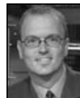
Scott Van Pelt