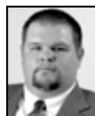
Tim Ahner Equipment